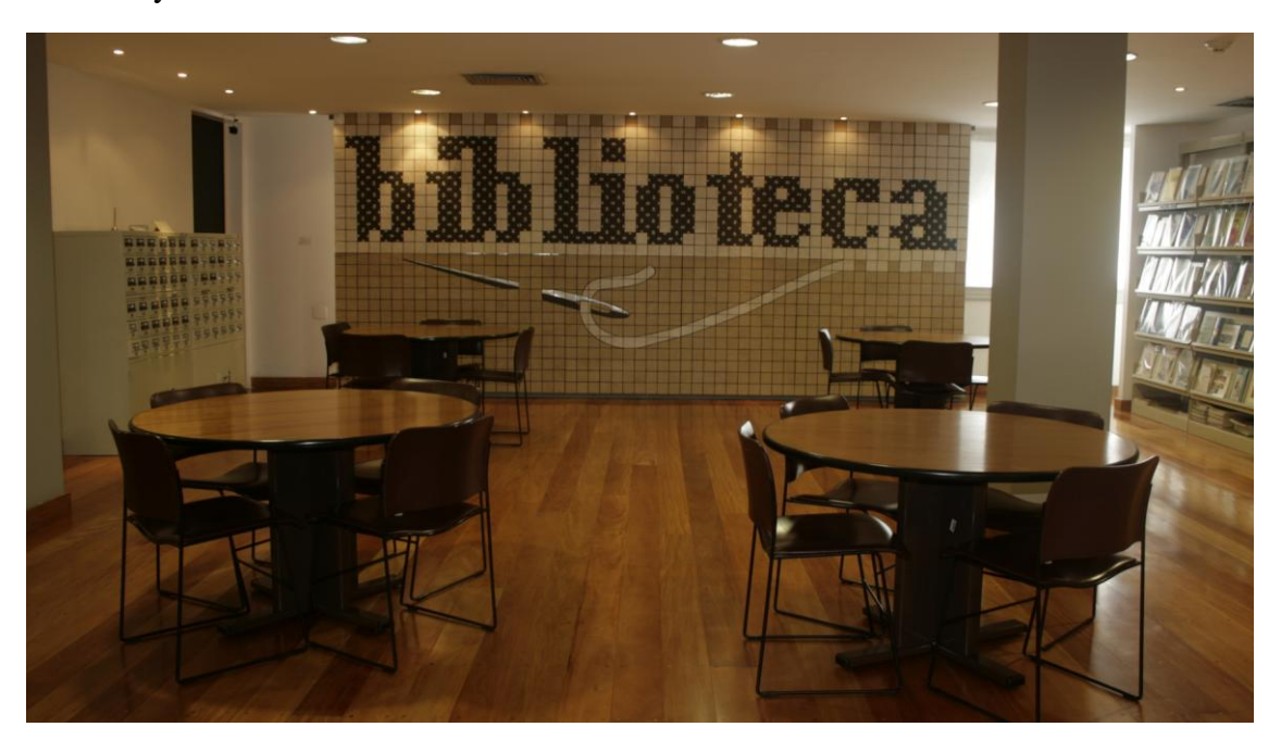
View of the new reading room, with an art work of Brazilian artist Regina Silveira.

The library was founded on 1959 and is located at Estação Pinacoteca building since 2006. The new place is much more comfortable and specially designed to accommodate the library.