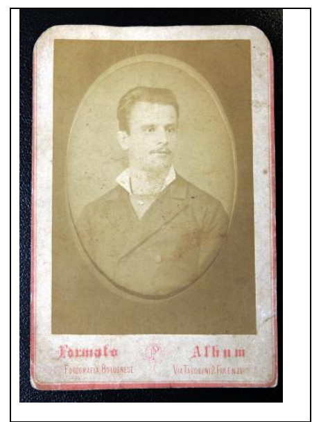
Almeida Júnior cabinet card (part of special collections of the library)

These databases can be searched simultaneously in the Portal, which will be described below.